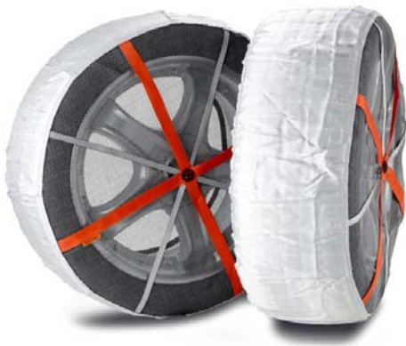
Autosocks improve traction on snowy roads. (17)

As production quantity has direct impact on inventory levels if there are disruptions in the logistical operations, it is important to take an integrated view on the problem in order to minimise losses. The current just-in-time approach of the business dictates that the production level of outbound products is lowered according to the demand (16). However, as the livestock of the farms cannot be shut down and will produce a constant supply of milk, alternative less perishable products like butter could be produced at higher quantity to limit the waste of raw milk. Alternatively, the milk could be ultra pasteurised to allow for longer durability and longer lead times.